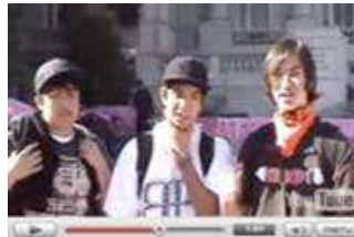
Watch veterans and youth speak out in our video, and sign our petition!