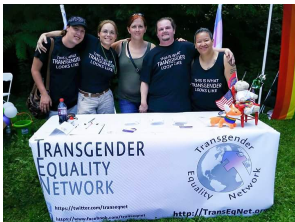
Transgender Equality Network