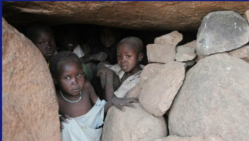
Nuba children hide in mountain caves to escape the bombings