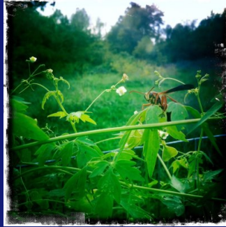
"A Dream of Spring"

OMNI Garden 9:00 am - 1:00 pm contact Steven Skattebo for info stevenskattebo@hotmail.com