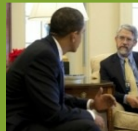
Obama's looking the other way

Hi THERE! Remember our TMI song? Too Much Information? (visit the YOUTUBE link on our website www.stillonthehill.com to hear us singing it at RADIO SHACK...what irony)